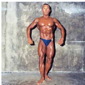
BELOW Body/Building #4 1997-2003 light jet print 42 x 126 cm