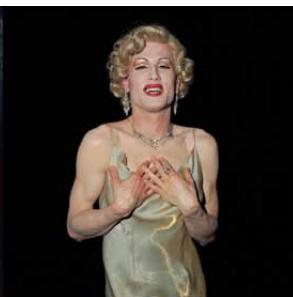
ABOVE Muse 2002 light jet print 80 x 240 cm