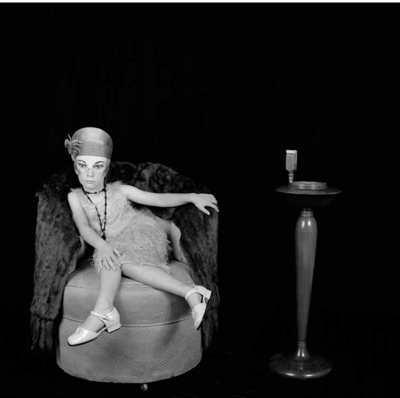
ABOVE Indian Brave 2002 pigment ink print 85 x 85 cm