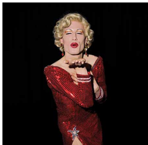
RIGHT Vale 2002 light jet print 80 x 240 cm