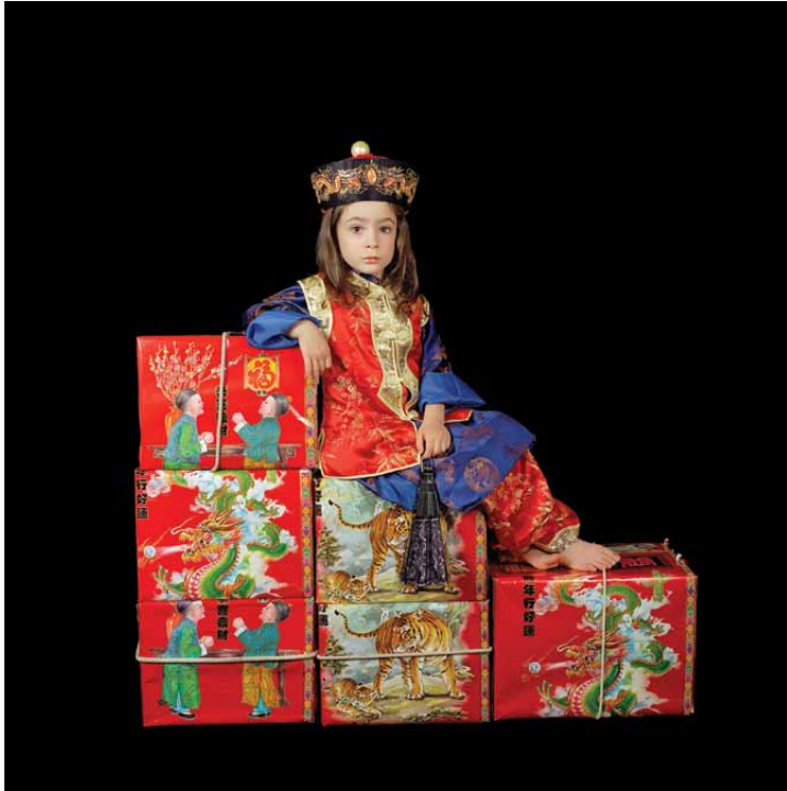
THIS PAGE Olympia as Lewis Carroll's Xie Kitchin as Chinaman on tea boxes (on duty) 2002 type C photograph 105 x 105 cm