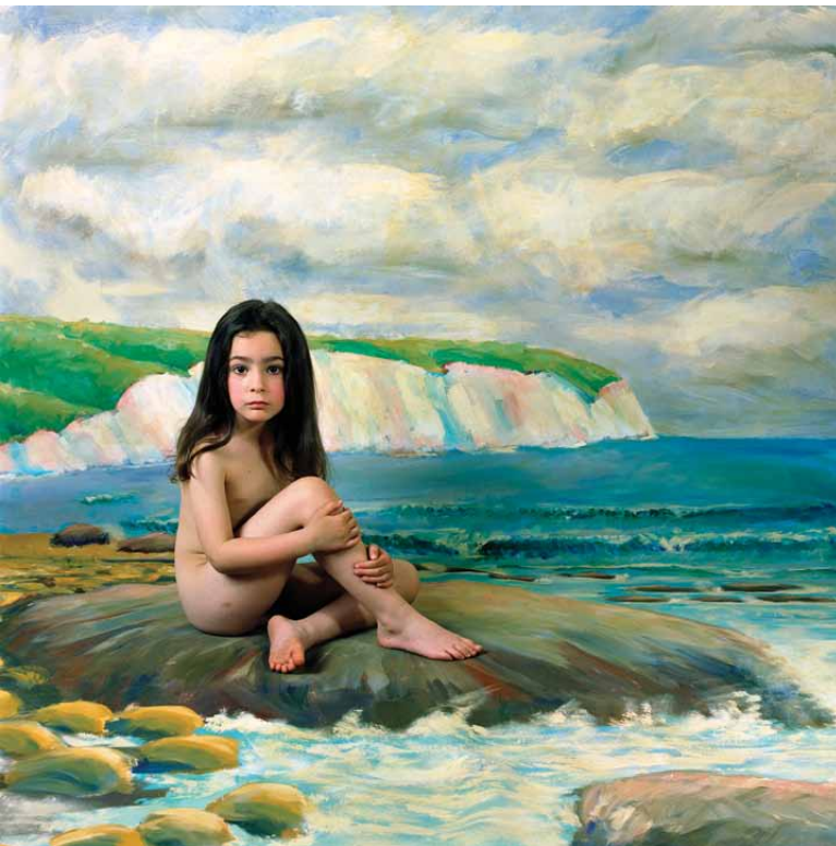
Olympia as Lewis Carroll's Beatrice Hatch before White Cliffs 2003 type C photograph 105 x 105 cm

to foreclose on such images, even when they are clearly art photographs, simply because the myth of the medium is predicated on an index of reality. Papapetrou was not immune to this charade and was famously embroiled in tabloid controversy when photographs of Olympia after Lewis Carroll's nineteenth-century images became caught up in the scandal surrounding the censorship of Bill Henson's photographs of semi-nude adolescents. What the press failed to acknowledge was that Papapetrou's photographs were not romantic renditions but carefully researched images that paid homage to Lewis Carroll as an advocate for children's rights. The signature image from this series— Olympia as Lewis Carroll's Beatrice Hatch before White Cliffs (2003)—is included in the exhibition since it is a catalyst that appears to spur Papapetrou on, driving her deeper into a performative practice that becomes more narrative and fantastical in the following decade.