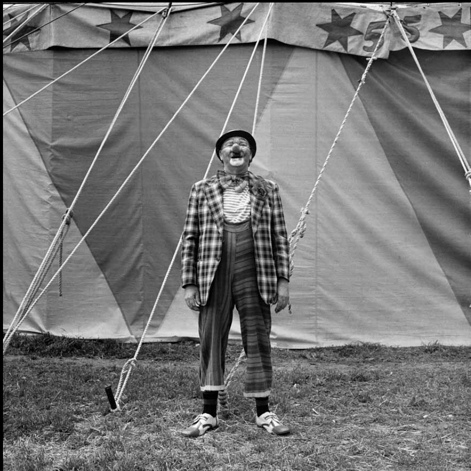
Laughing clown, Silver's Circus 1990 pigment ink print 45.8 x 45.8 cm