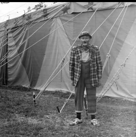
Clown in striped pants, Silver's Circus 1990 pigment ink print 45.8 x 45.8 cm