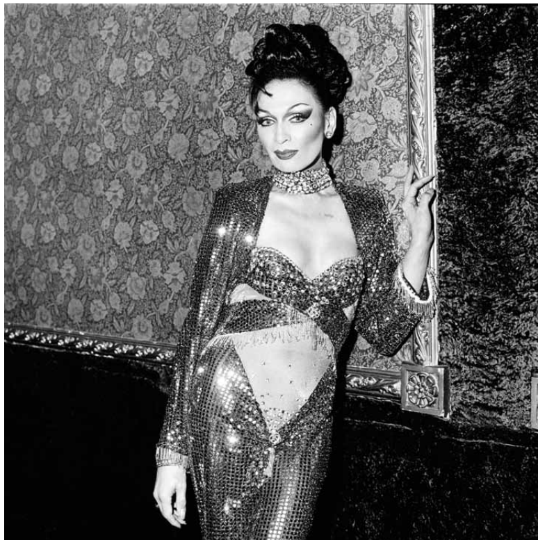
Drag queen wearing cut out dress 1993 gelatin silver photograph 28.5 x 28.5 cm