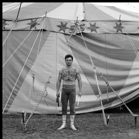
LEFT Lion Tamer, Silver's Circus 1989 pigment ink print 45.8 x 45.8 cm