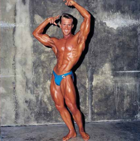
LEFT Body/Building #2 1997-2003 light jet print 42 x 126 cm