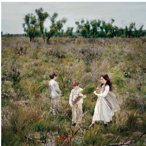
The Wimmera 1864 #1 2006 pigment ink print 105 x 105 cm