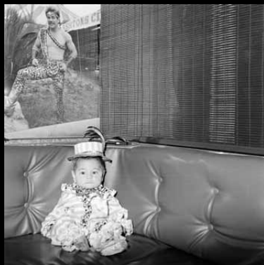
ABOVE Baby clown, Ashton's Circus 1990 pigment ink print 45.8 x 45.8 cm