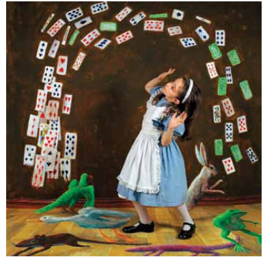
The Flying Cards #2 2004 type C photograph 105 x 105 cm

How would you like your work to be remembered?