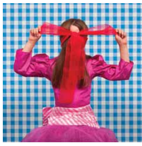
Obscured World, 2013 Giclée print (edition 1 of 6) 75 x 75cm