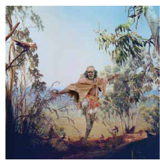
Birds of Australia, 2006-07 Type-C photograph (edition 4 of 10) 80 x 80cm Banyule Art Collection | acquired 2009