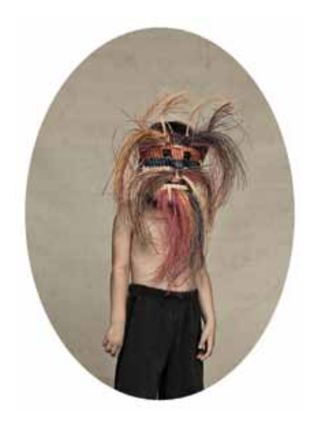
Arco Iris, 2014 C-Type print (edition 1 of 8) 75 x 54cm Courtesy of the artist and Helen Gory Galerie, Melbourne

Arachne, 2014 C-Type print (edition 1 of 8) 45 x 32cm (hand-carved oval frame) Courtesy of the artist and Helen Gory Galerie, Melbourne