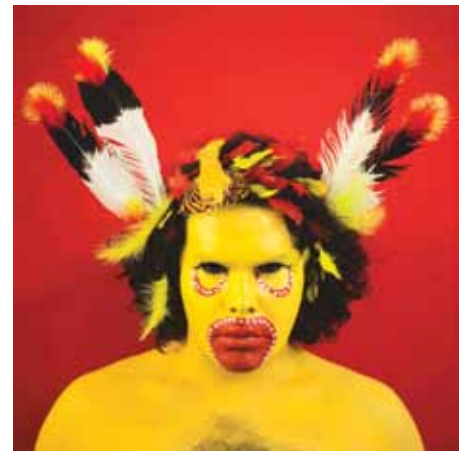
Howl Your Troubles, 2011 C Type Print (edition of 10+AP) 100 x 100cm

The Devil Made Him Do It, 2011 C Type Print (edition 7 of 10) 100 x 100cm Banyule Art Collection | acquired 2012