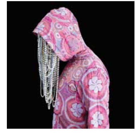
Untitled #1 King Billy series, 2010 C Type Print (edition 1 of 10) 100 x 100cm