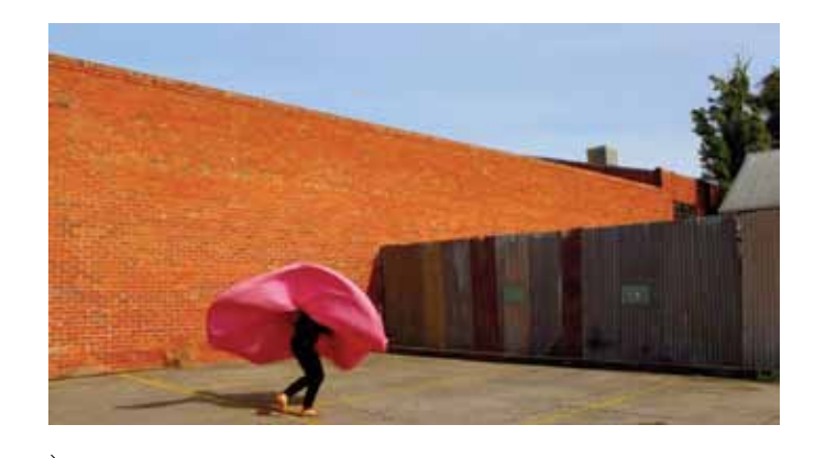
Tania SMITH Untitled (Refrain), 2013 HD video (silent) 1 minute, 10 seconds Courtesy of the artist