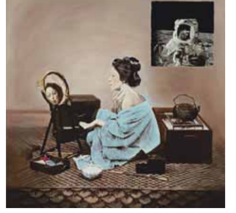
Charles GREEN / Lyndell BROWN

Lik Lik Mary Muffat, 2009 Inkjet print on photo rag 130 x 110cm (edition 2 of 5)