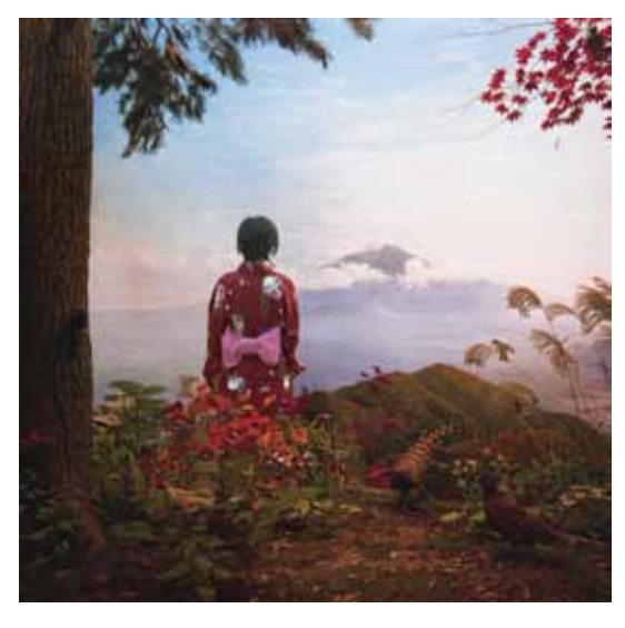
Anne ZAHALKA Exotic Birds, 2006-07 Type-C photograph (edition 8 of 10) 80 x 80cm Banyule Art Collection | acquired 2009