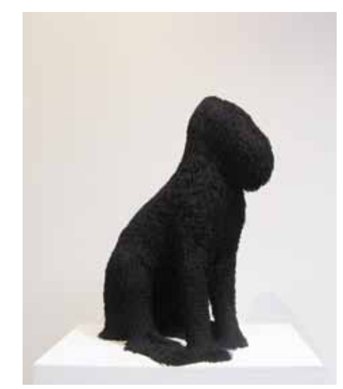
Black Fox II, 2013 High density taxidermy foam and rayon tassels 52 x 24 x 37cm Courtesy of the artist, Gould Galleries, Melbourne and Martin Browne Contemporary,

Acrylic yarn, polyurethane mannequin, pins, hot glue and painted timber base 130 x 50 x 64cm (base 45 x 60 x 60cm) Courtesy of the artist, Gould Galleries, Melbourne and Martin Browne Contemporary, Sydney