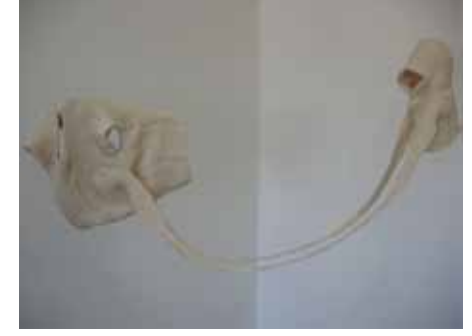
The World is a Dangerous Place, 2004 Wool Dimensions variable Courtesy of the artist and Daine Singer, Melbourne

The World is a Dangerous Place, 2004 Pegasus print 50.5 x 68cm Courtesy of Maroondah Art Collection