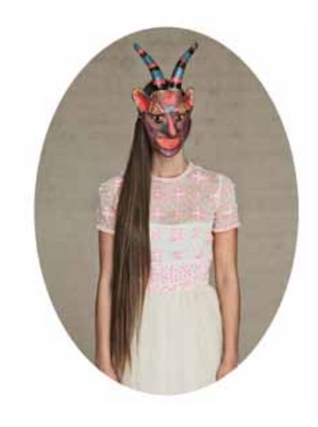
Pandora, 2013 C-Type print (edition 1 of 8) 75 x 54cm