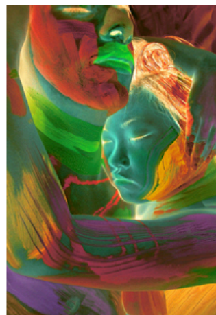
Koh Sangwoo - The Hug