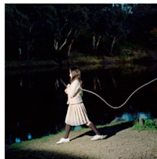
Polixeni Papapetrou - Dreams are Like Water