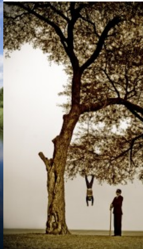
Museum Belvédère, © Sana Khan

Museum Belvédère - Main Venue Oranje Nassaulaan 12 8448 MT Heerenveen-Oranjewoud, The Netherlands www.museumbelvedere.nl Tuesday trough Sunday, 11 am - 5 pm Admission: €8