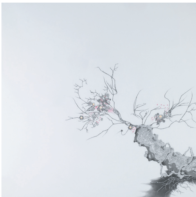
Hiroe Saeki, Untitled , 2006, pencil and acrylic on paper

The principal materials used by Hiroe Saeki in her works are brilliant white Kent paper and a propelling pencil with a very sharp lead sharpened with sandpaper. Her drawings leave ample white space. The motifs she draws range from such plant and animal subjects as flowers, butterflies, and mushrooms, to fashion accessories and shoes, drinking glasses and other small objects, and even sea scenes and landscapes featuring castles. Saeki draws her subjects in all their ever-changing forms with a meticulously delicate touch. Her work is reminiscent of traditional Japanese kacho-fugetsu ga (paintings of birds, flowers, and other natural motifs), but her drawings give equal weight to the overall image and the details, creating a sense of space not seen hitherto.