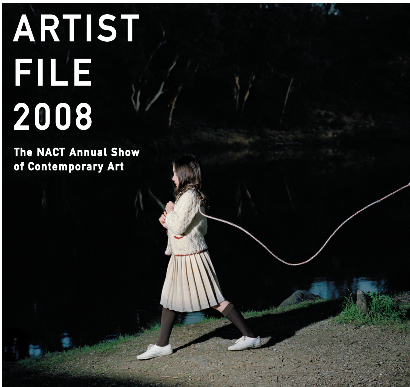
Polixeni Papapetrou, Dreams are like Water , 2008, pigment ink prints

The NACT Annual Show of Contemporary Art