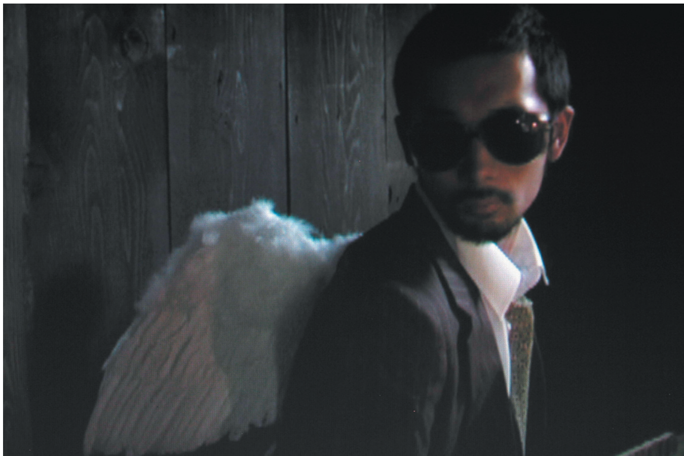
Mio Shirai, L'Amour , 2007, video still, Support: BankART 1929

Presenting those works of contemporary artists, we believe that Artist File 2008: The NACT Annual Show of Contemporary Art should provide a great opportunity to experience the richness, vitality and potentiality of continuously diversifying artistic expression of today. As an annual project, we also believe that this series of exhibition will trace out a cross section of our time, that gradually comes to reveal and reflect the silhouette of an era.