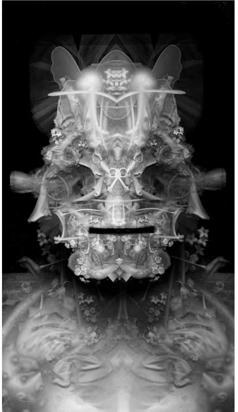
Murray McKeich Pzombie 2.3 2011, Archival Pigment Print, courtesy of the artist.