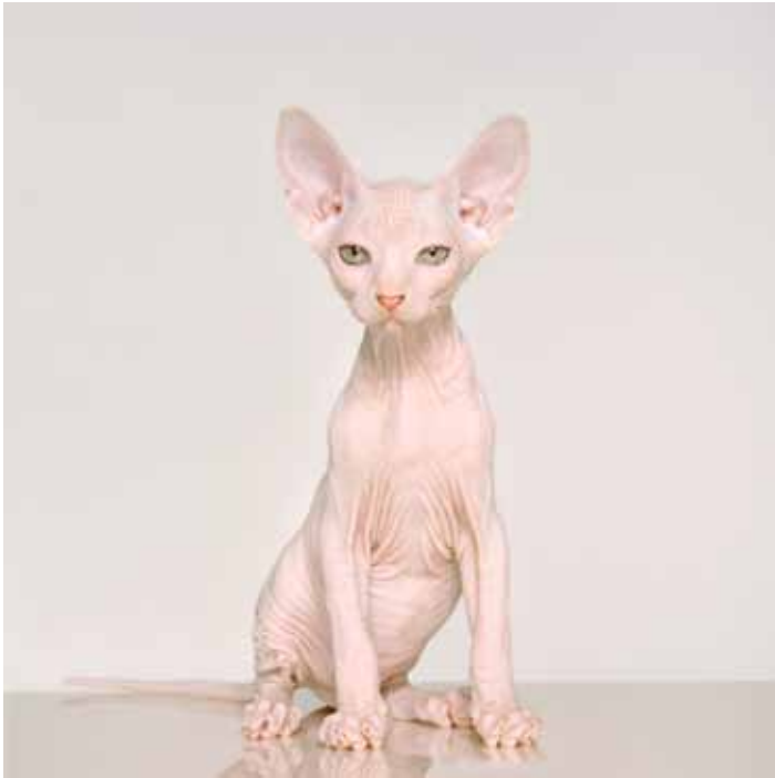
Petrina Hicks Sphinx 2011, Lightjet print