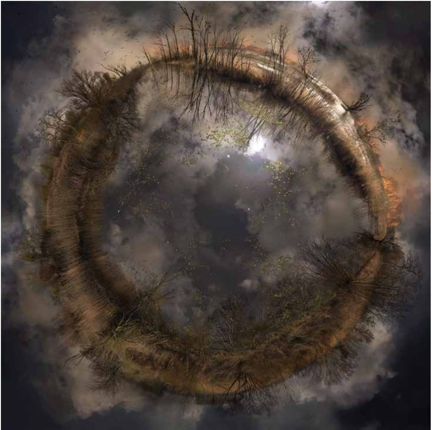
Catherine Nelson The End of Winter 2011, Pigment Print Facemounted on Plexiglass